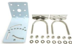
Pole mount accessory